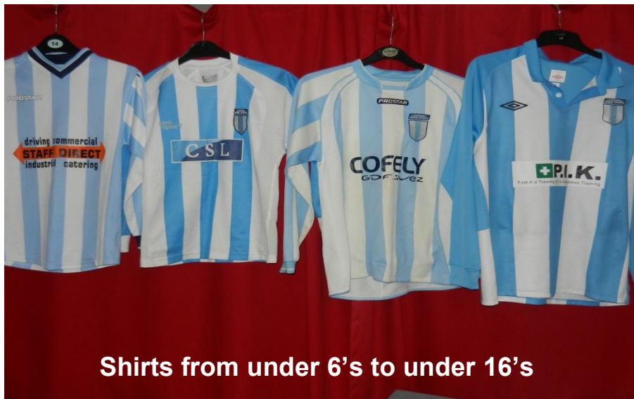
Shirts from under 6's to under 16's